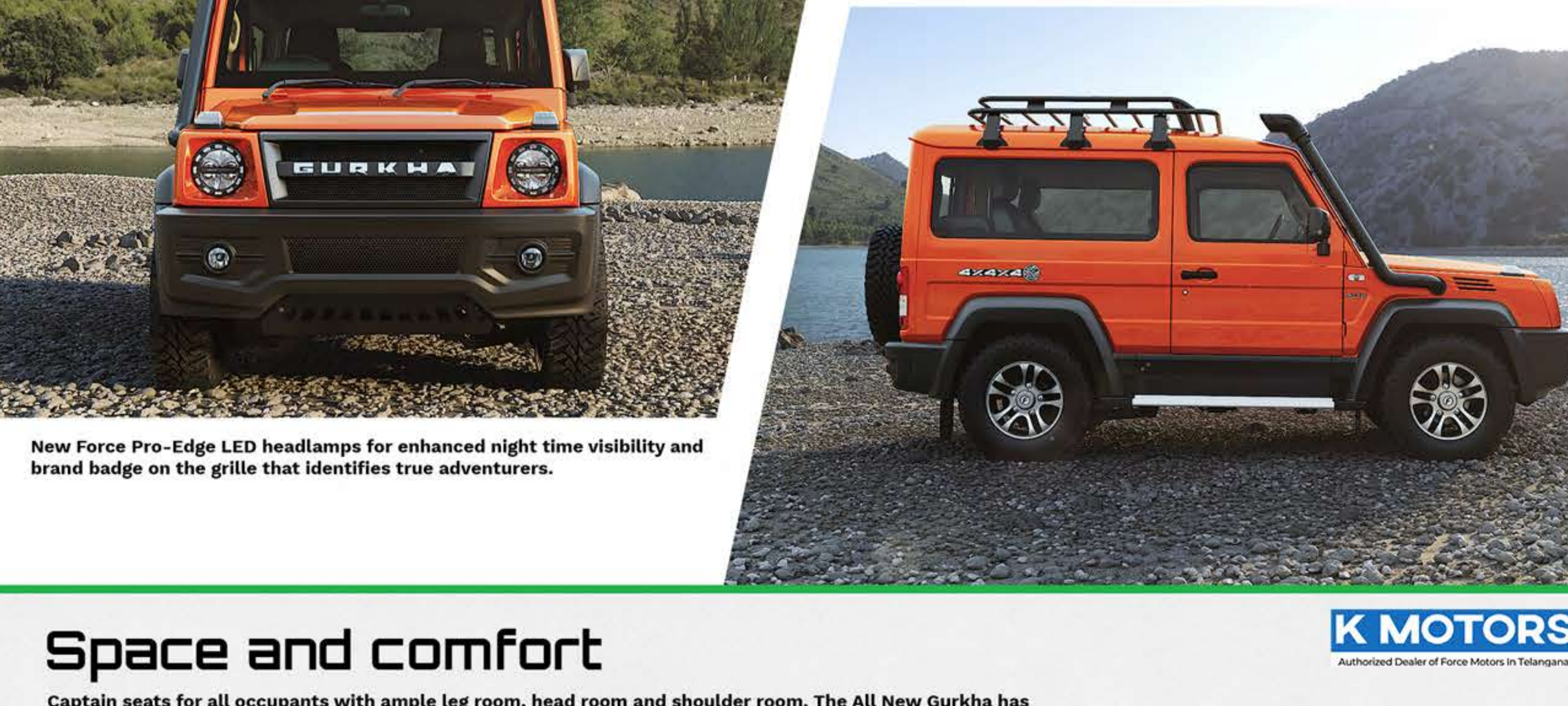
New Force Pro-Edge LED headlamps for enhanced night time visibility and brand badge on the grille that identifies true adventurers.